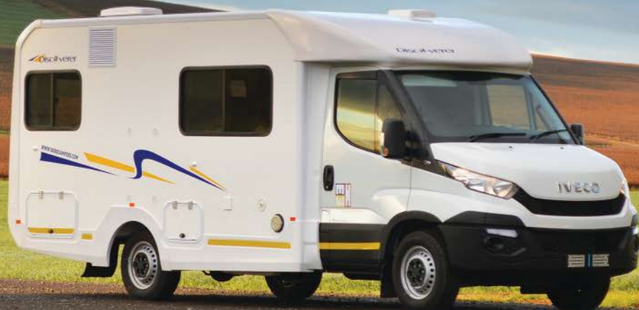
model shown: Discoverer 4