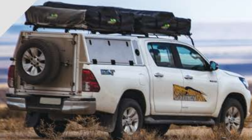
model shown: Discoverer DC 4x4